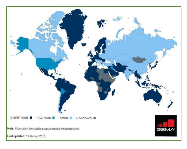
Fig. 2 Map for country specific RF limit information

For fixed radiating stations, the exposure limits for general public, unperturbed and uncontrolled environment (unlike the workers/ occupational case) are the most relevant to the public. Telecommunications regulators tend to focus on public exposures, but other regulatory authorities are often interested in worker exposures. The European Union (EU) Directive 2013/35/EU ([13] Annex III Table B1) adopted ICNIRP values for exposure of workers. The 'general public' limits of ICNIRP 1998 (Table 7) and the European Community (EC) 1999/519/EC ([14] Annex III Table 2) are identical, since ICNIRP levels have been endorsed by the European Commission's Scientific Steering Committee [15] 2015 SCENIHR Opinion. ICNIRP 1998, 1999/519/EC and ANSI/IEEE C95.1-20052 [16] for radiations from (mainly) fixed stations above 10 MHz specify closely identical exposure limits. Fig. 2 [3] depicts, that most countries adopt the ICNIRP 1998 reference levels for the public.