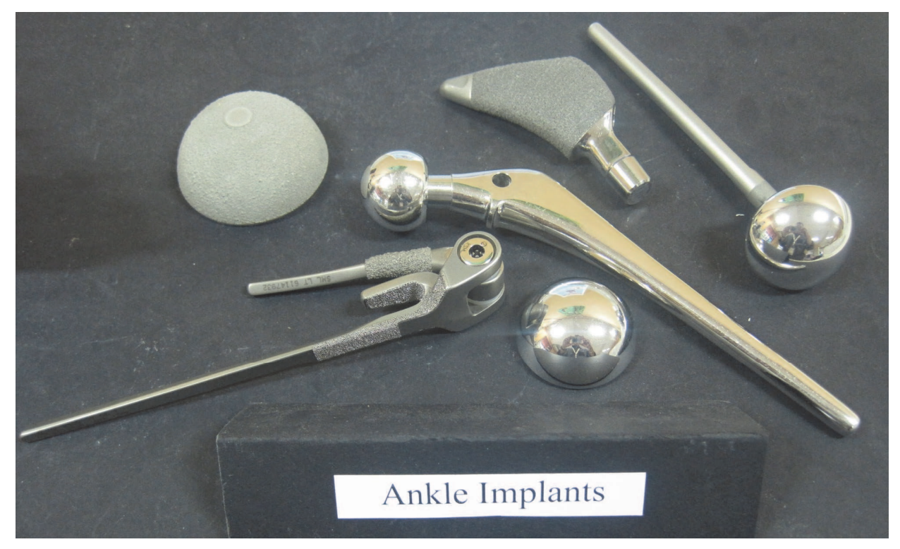
Fig. 1. A set of ankle implants.