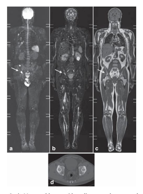
Figure 2. A 64-year-old man with malignant melanoma and multiple metastases. A bone lesion (arrow) measuring approximately 15 mm in longest diameter was detected on the right acetabulum on maximum intensity projection (MIP) image of DWI (a); coronal T2-STIR image (b) and coronal T1W image (c); The lesion was not detectable on CT (d).

There were some limitations in our study. Firstly, we could not verify the pathologic findings by biopsy for practical and ethical reasons. Secondly, we did not evaluate DWI completely separated from other MR sequences. We chose this way of interpretation since, apart from malignant tumors, artifacts and a number of benign lesions and normal anatomical structures like spleen and prostate also show high signal intensity